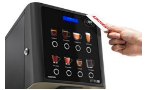
RFID Reader Kit For product recharge card or cashless systems