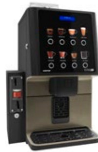
Validator module kit Ready to install a coin validator.