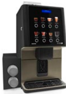
Cup module kit For dispensing cups.